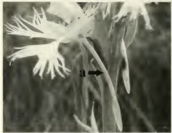
FIG. 2. Platanthera praecleara flower, lateral view, showing nectar spur (a).

position of a potential nectar seeking insect, and increases the likelihood that one or both viscidia will come into contact with a likely pollinator. The pollinium is pulled from the sheath when a pollinator contacts the viscidium and then withdraws from the flower (Darwin 1904, Dressler 1981, 1993).